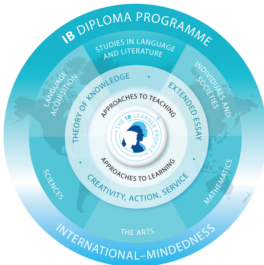
Figure 1 Diploma Programme model

The course is presented as six academic areas enclosing a central core (see figure 1). It encourages the concurrent study of a broad range of academic areas. Students study: two modern languages (or a modern language and a classical language); a humanities or social science subject; a science; mathematics and one of the creative arts. It is this comprehensive range of subjects that makes the Diploma Programme a demanding course of study designed to prepare students effectively for university entrance. In each of the academic areas students have flexibility in making their choices, which means they can choose subjects that particularly interest them and that they may wish to study further at university.